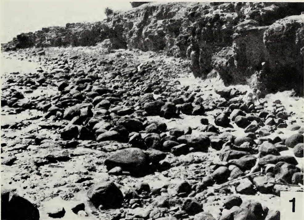
Figure 1.—Type locality of Paratheuma makai , beach at Kapaa, Kauai, Hawaii.

Four adults of each sex were measured. Total length was measured from anterior carapace margin (or anterior eye margin when eyes projected beyond carapace) to the base of the spinnerets. Some specimens from Kauai were reared